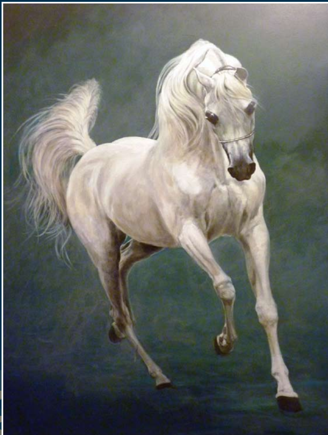
Escape de Navarrone